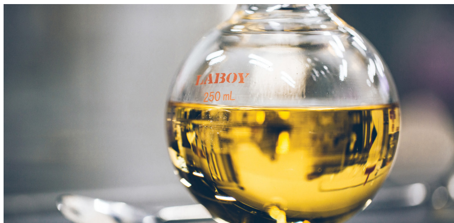
It might be best to add cannabinoids (CBD) during the formulation's oil phase.

"While there continues to be momentum from a federal standpoint toward the path of legalization, CBD integration into food and beverage currently isn't